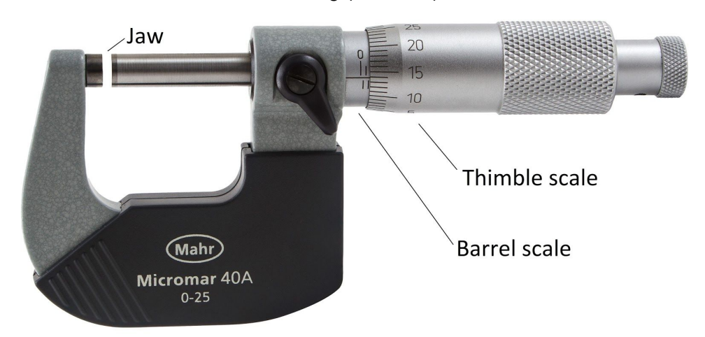
Image source: Lucasbosch, CC BY-SA 3.0, labels are added to the image